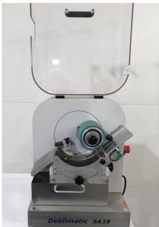
Image of the Deblimatic® SA18 with the cover in the opened position

Additional cassettes can be ordered separately. The Deblimatic® SA18 is supplied with two press-out rolls with different rubber hardnesses. The softer of the two rolls is particularly suitable for the deblistering of capsules without damaging the capsule.