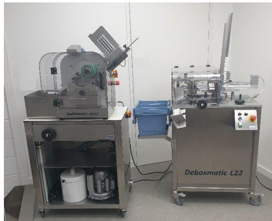
Deboxmatic L17 & Deblimatic A19